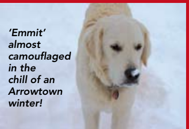
'Emmit' almost camouflaged in the chill of an Arrowtown winter!